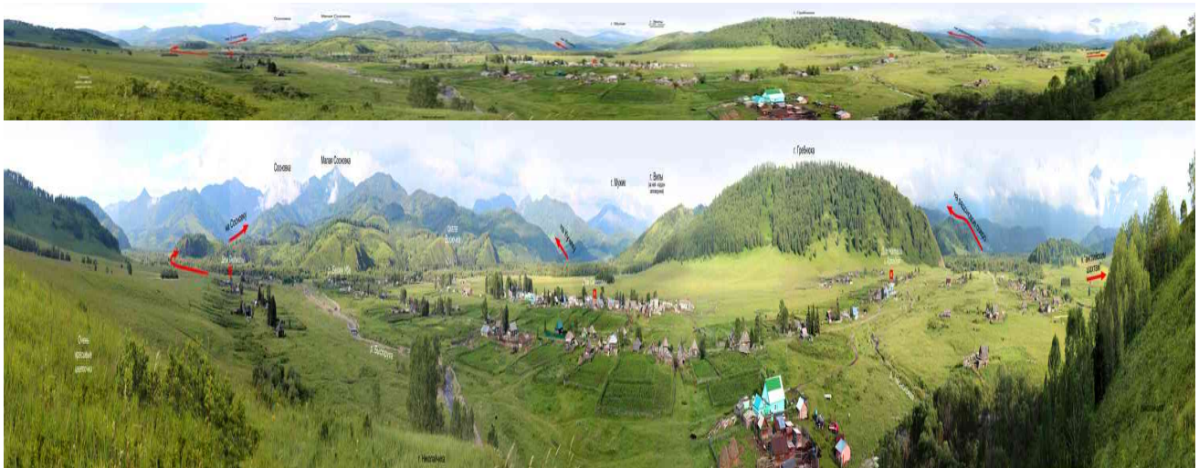
Fig. 1. The project of the promotional panorama of the village Poperechnaya

The panorama (fig.1) will be used as the basis of the internet site about the village Poperechnaya and for setting of the information center in the village and of the information center of the West-Altai nature reserve.