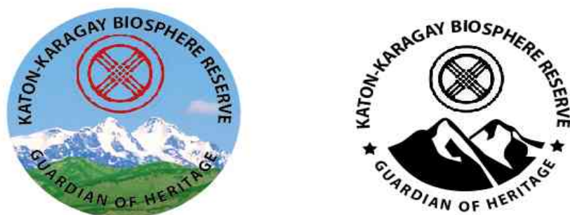
Fig.4. Project of sign of guardians of heritage of the Katon-Karagay biosphere reserve partners

The sign of guardians of heritage includes the image of the mountain Belucha and the Kazakh symbol of jurt, home, family, well-being (fig.4)