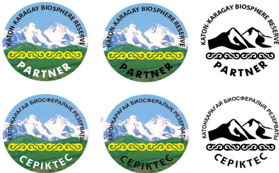
Fig.3. Project of sign of the Katon-Karagay biosphere reserve partners

The main requirements to signs were discussed with officials of the Katon-Karagay biosphere reserve. On the base of the results of the discussion the project of signs were elaborated. The project of sign of the Katon-Karagay biosphere reserve partners includes the image of the mountain Belucha and national kazakh ornament (fig. 3).